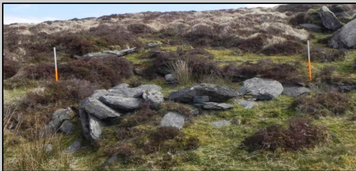
View from SW

Circular area (dims. 2.5m N-S; 2m E-W) defined by low drystone wall (H 0.3m) of medium sized flagstones. It is cut into the slope N->ESE where a type of retaining wall (int. H 0.55m) has been built to compensate for the incline. Interior is level and grass covered.