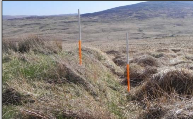
Bank at NNW