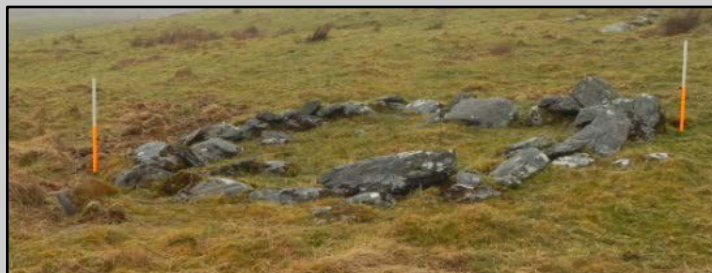
View from E

Located c. 50m to SE of hut site CH13. Circular area (dims. 3.5m NE-SW; 3.25m NW-SE) defined by a drystone wall (H 0.3-0.45m).