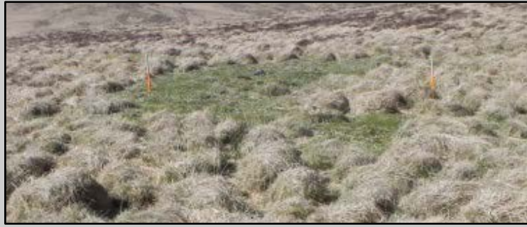
View from E