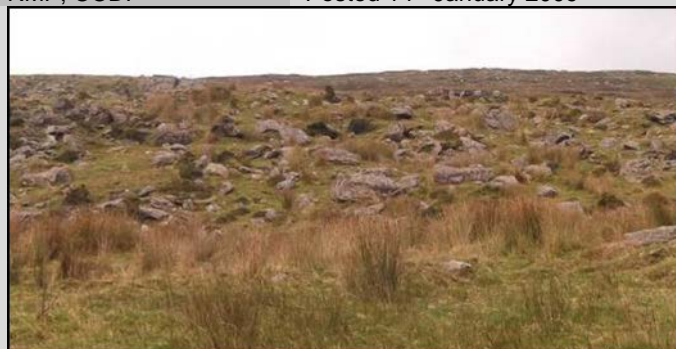
Positioned to right of bush in centre of plate on edge of platform

Posted 14 th January 2009