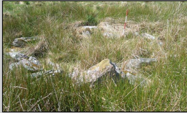
View from NE