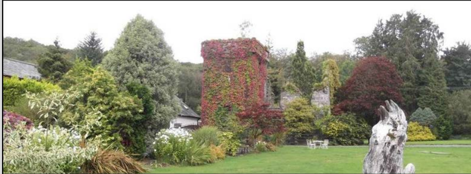
From road to south

(Archaeological Survey of Ireland, Record Details) on http://www.archaeology.ie Posted 14 th January 2009