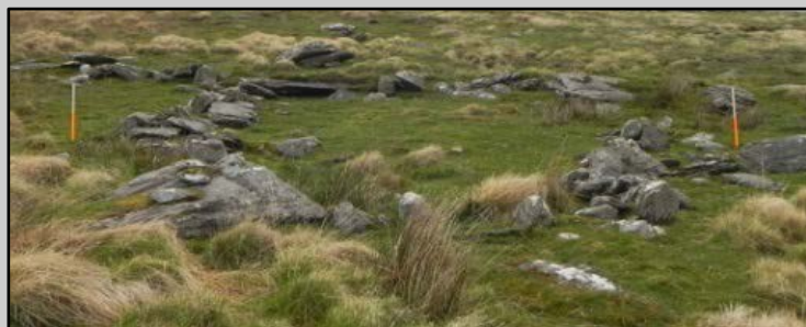
View from S

Sub-rectangular area (dims. 9.5m N-S; 5.75m E-W) defined by remains of collapsed, drystone wall (Wth 0.75m; H 0.05m) and natural boulders. Possible entrance at S. Interior is grass-covered with a S-facing slope. Associated with drystone field wall (long axis E-W).