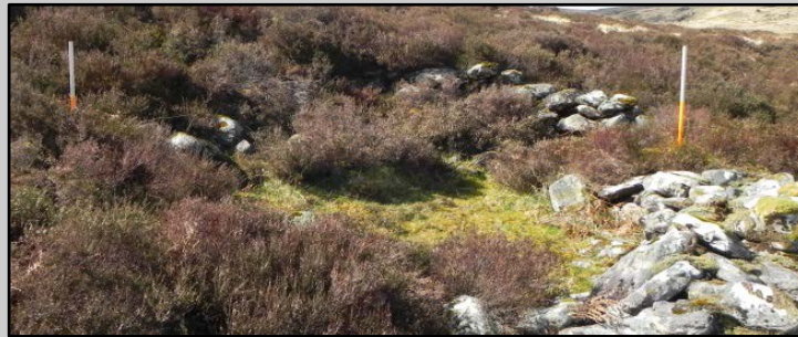
View from S

Circular area (dims. 3m NW-SE; 2.75m) defined by low drystone wall NE->S->NW (H 0.3- 0.5m) and incorporated into field wall (long axis E-W) to N.