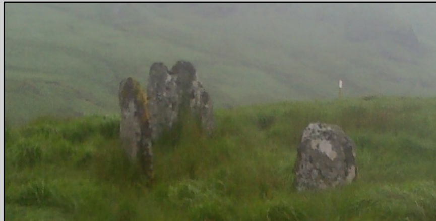
View from NE

It is likely, given the evidence, that this monument may represent a chambered tomb or a stone ring/circle (Walsh, 1997, 11).