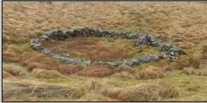
View from NE