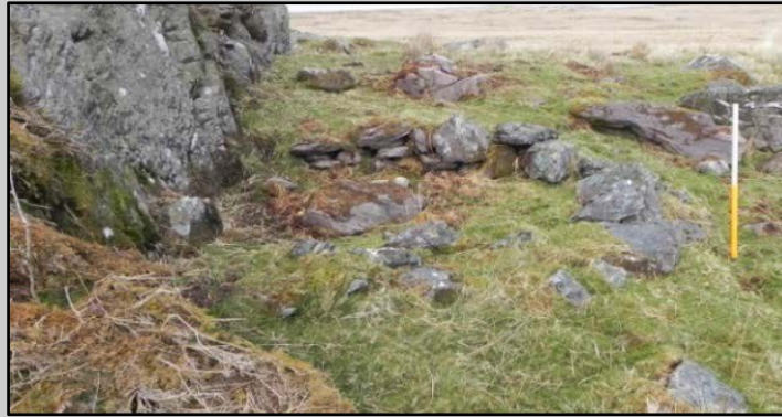
View from SW