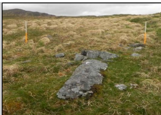
View from E