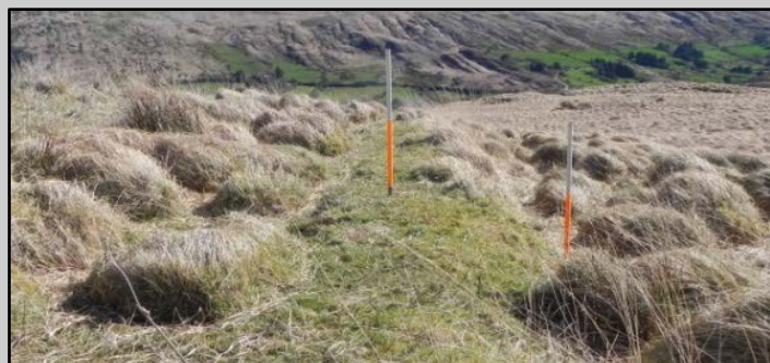
View from W

Rectangular area (dims. 20m E-W; 10m N-S) defined by earth and stone bank (Wth 2.1m; int. H 0.1m; ext. H 0.7m) N->E->SW and W->NW, and largely overgrown, possibly representing a sheepfold. This feature has been raised on the downslope (E) to create a relatively level interior, which incorporates a raised sub-rectangular (booley hut -platform?) area (dims. c. 8m N-S; c. 2m N-S).