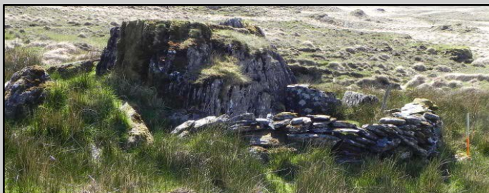
View from E

Rectangular area (dims. 5m E-W; 2.2m N-S) defined by drystone wall (Wth 0.5m; H 1m) E->N->W and natural rock outcrop (H 2.5m) forming S side. Entrance (Wth 0.75m) in W-wall; Upright timber post in entrance and possibly rebuilt and reused as a sheep fold.