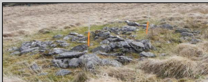
View from NW

A pair of conjoined (booley) hut sites (long-axis E-W). The eastern hut site (diam. 1.2m) is defined by a collapsed, drystone wall (Wth 0.75m; H 0.15-0.25m). The adjoining western hut site (diam. 1.5m) is defined by a similar collapsed, drystone wall (Wth 0.65m; H 0.15-0.25m). Located within an oval area (dims. 6.5m E-W; 4.5m N-S) defined by a kerb of low profile stones (H 0.25m) which is well defined S->W->N and intermittent N->E->S.