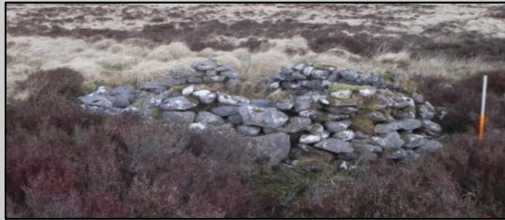
View from S

Oval area (dims. 2.75m E-W; 2m N-S) defined by drystone wall (Wth 0.5m; H 0.8-1m); generally well preserved, but collapsed on W side. One of four hut sites (CH26, -27, -28 & -29) in this immediate area.