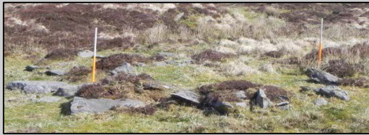
View from S

Circular area (dims. 2.8m E-W; 2.6m N-S) defined by remains of collapsed drystone wall (Wth 0.6m; H 0.2-0.4m) partially covered in heather and mosses. The ground surface has been raised on the downslope to W to create a level interior.