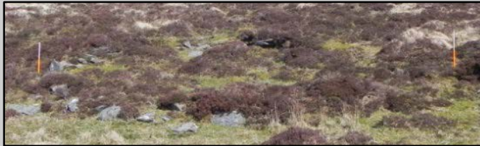
View from W

This is one of a cluster of five hut sites (CH19, -20, -21, -22 & -24) in this particular area. Oval area (dims. 8m N-S; 6m E-W) defined by dry stone wall (H 0.35m) which is covered with a grassy/heather sod in most places. It is cut into the slope NW->NE where a type of retaining wall (int. H 0.4m) has been built to compensate for the incline. Interior heather and grass covered, with a W-facing slope.