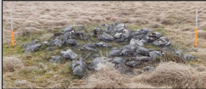
View from W

Oval area (dims 3.1m E-W; 2.25m N-S) defined by the remains of a collapsed drystone wall (H 0.3m).