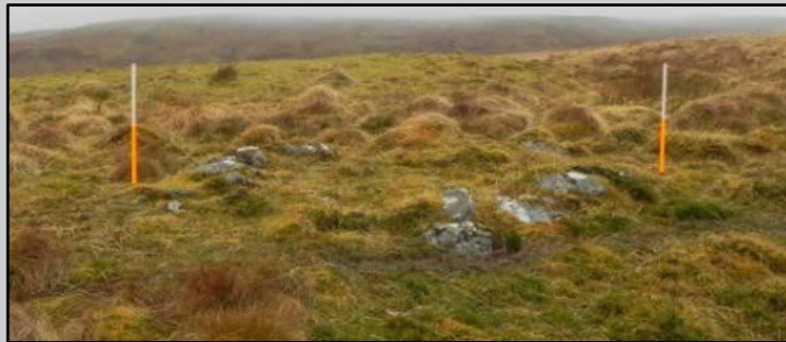
View from E

This is situated on a SW-facing slope of Barnastooka ridge and not marked on any O.S. maps. Sub-circular area (dims. 2.75m E-W; 2m N-S) defined by low, moss covered drystone wall (average H 0.2m). Interior is level and grass covered. Linked to hut site (CH14) by an intermittent, gently winding, narrow stone wall.