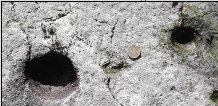
Possible Cup Marks