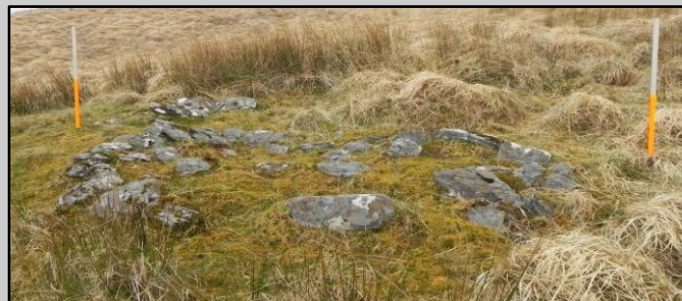
View from W

Low profile oval area (dims. 3.5m E-W; 2m N-S) defined by remains of low stone wall (H 0.15- 0.2m). Small area (dims. 2m N-S; 1.2m E-W) defined by stone within western sector.