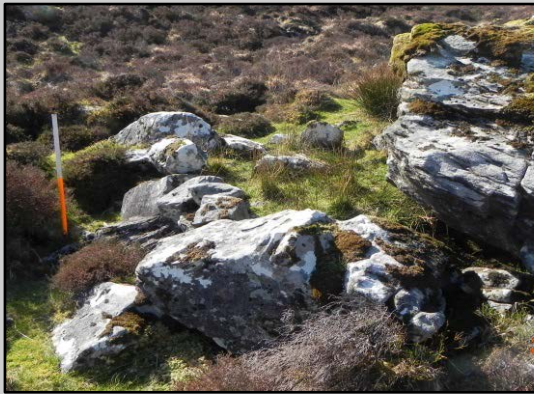
View from NW

Rectangular area (dims. c. 2.2m NW-SE; 1.3m NE-SW) defined by remains of a drystone wall (H 0.7m) NNW->NE->ESE and a natural boulder to SE and W->NW. There is an opening (H 0.65m) under the large boulder at W for possible shelter or storage. Lots of naturally occurring stone and rock outcrop in this area which makes this shelter well camouflaged on the hillside.