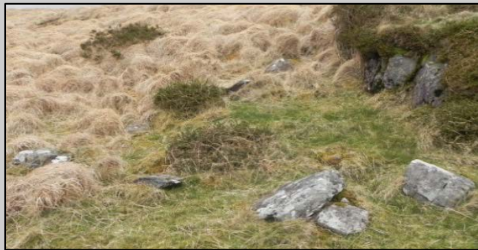
View from S

Sub-triangular area (dims. 6m NE-SW; 4m NW-SE) defined by low, intermittent drystone wall S->W->N and utilising the face of a natural rock outcrop (H c. 2m) to E. Interior is grass covered with a steep S-facing slope.