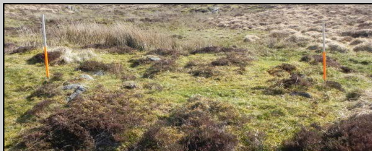
View from W

Low profile circular area (dims. 2.5m E-W; 2.2m N-S) defined by scarp (Wth 0.5m; H 0.25m) all around except N->NE, where it is flat. It comprises of a single kerb (Wth 0.25m) of mossed-over stones. Ground surface on downslope has been raised to create a level interior. Interior moss- covered with occasional heather.