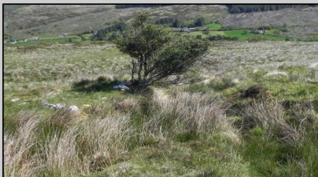
View from SW

Located in an area of grass, on a general NE-facing slope, with a grass covered track c. 4m to W at its closest point. This hut site utilises a natural 'shelf' of rock outcrop in the landscape. It is a sub-circular feature (dims. c. 7.5m E-W; c. 6.5m N-S) defined by a low, drystone wall (overall Wth 2.4m; int. H 0.15m; ext. H 0.55m) S->W->N; scarp (Wth 1.3m; H 1.7m) N->NE; low scarp (Wth 0.3m; H 0.3m) E->SE. The interior is generally level and is covered by grass and rushes. There is a holly tree growing within the interior at N and the feature has been truncated through its eastern sector by modern land drain (long axis NE-SW; Wth 3m; D 1.1m) which enters at SE and exits at NE