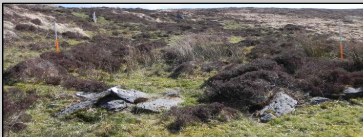
View from W

Oval area (dims. 4m NW-SE; 3m NE-SW) defined by remains of collapsed drystone wall (Wth 0.8m; H 0.3-0.4m) covered with heather and mosses. Possible entrance (Wth 0.8m) at E. Interior is generally level.