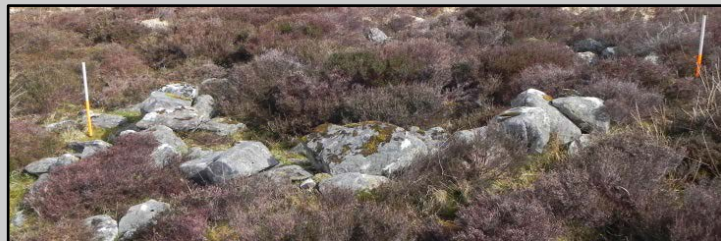
View from S

Circular area (diam. 4m) defined by drystone wall (Wth 0.5m; H 0.6m). Interior appears generally level and has a dense growth of heather.