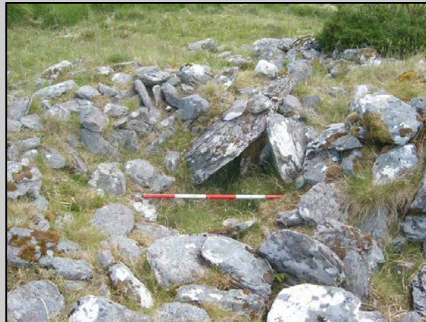
Interior from W

The foundations of this sub-circular hut site were identified on a level terrace on the south facing slope. It comprises a collapsed wall measuring up to 1.5m in thickness and enclosed an internal area measuring 1.6m north-south by 2m east-west. A 1m wide gap in the east wall appears to form the entrance.