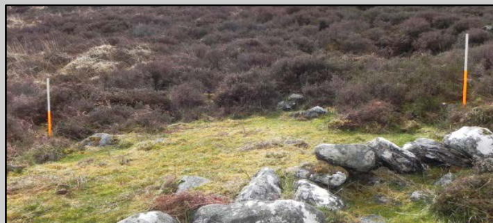
View from N

Located to immediate E of hut site CH27. Low profile remains of a circular area (dims. 3.4m N-S; 3m E-W) defined by moss covered drystone wall (Wth 0.5m; int. H 0.15; ext. H 0.15m). Cut into hillslope (D 0.4m) E->S->W where there is a dense growth of heather. Interior is level and moss-covered.