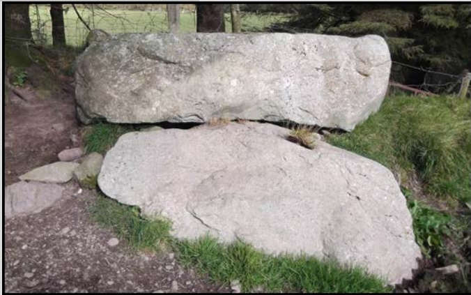
SITE BH1 Possible Decorated Stone – upper boulder