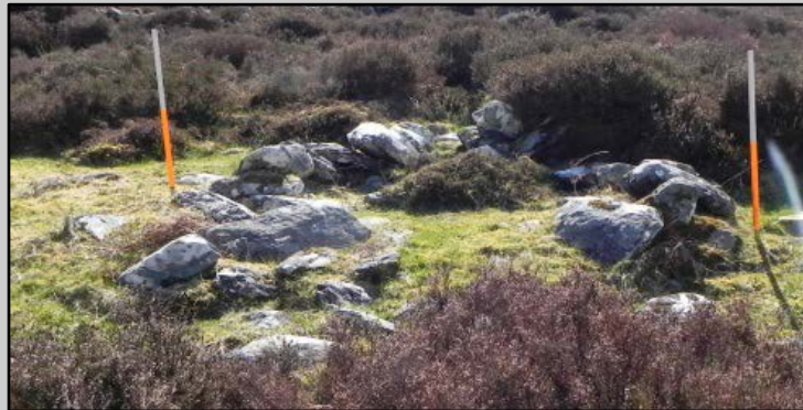
View from N

Circular area (diam. 1.5m) defined remains of a low drystone wall (Wth 0.6m; int. H 0.35- 0.5m; ext. H 0.25-0.5m). Interior is grass covered on a gentle N-facing slope.