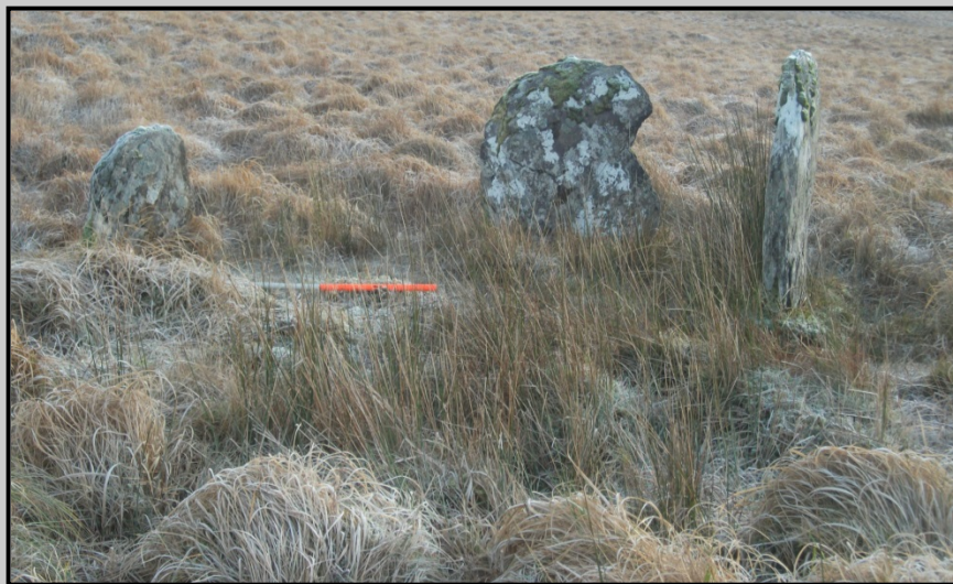
View from S