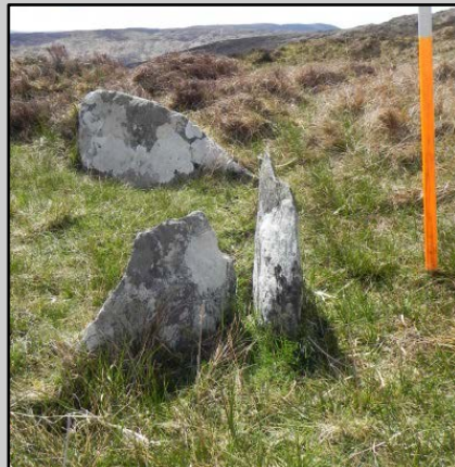
View from N

Three upright, narrow stones located on a level terrace. Southern stone (L 1.1m; H 0.4m; Wth 0.1m); Western stone (L 0.45m; H 0.35m; Wth 0.04m); North-western stone (L 0.5m; H 0.35m; Wth 0.04m). There is a fourth stone visible at ground level on the eastern side of this arrangement. Similar in nature to CH2 and may represent a former chambered tomb.